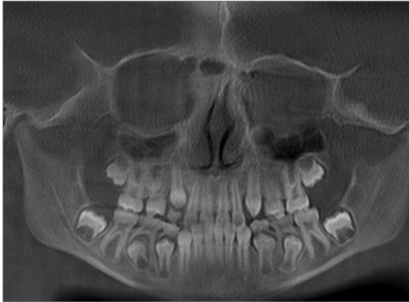
True anatomical picture is not revealed with "2D" view